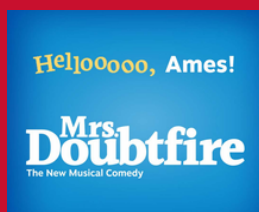
Mrs. Doubtfire February 4