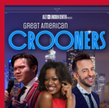
Great American Crooners March 1