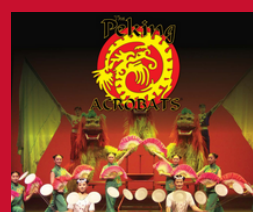
The Peking Acrobats March 3