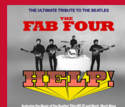
The Fab Four April 10