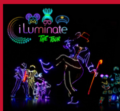
iLuminate October 17