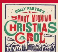
Dolly Parton's Smoky Mountain Christmas Carol December 15