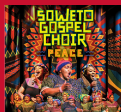
Soweto Gospel Choir November 10