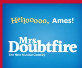
Mrs. Doubtfire February 4