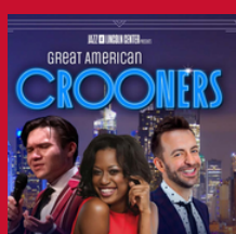
Great American Crooners March 1