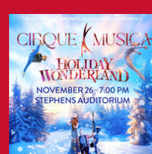
Cirque Musica November 26