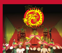
The Peking Acrobats March 3