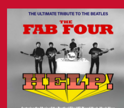
The Fab Four April 10