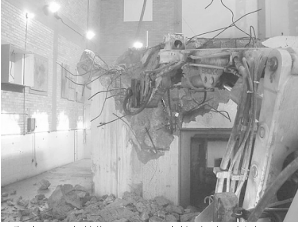
The nuclear reactor was demolished last summer; its remains were hauled to a disposal site in the South.

The demolition contract was awarded to Duke Engineering Services, a Massachussetts-based company that worked with subcontractors, occupational safety personnel, and radiation specialists, who constantly monitored air quality and contamination levels in construction debris. Special filters were installed to collect contaminated particles that might escape, and each day samples of the concrete leaving the site were thoroughly tested for safety levels.